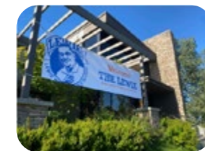
Our host golf club, Spring Creek Golf & Country Club in Ripon, is one of the best golf experiences in the valley.