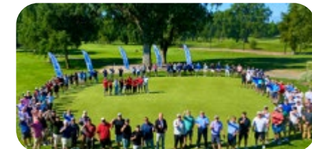
The Lewie 2025 SOLD OUT! Sign up TODAY at fhct.life/thelewie

Register your team TODAY at fhct.life/thelewie .